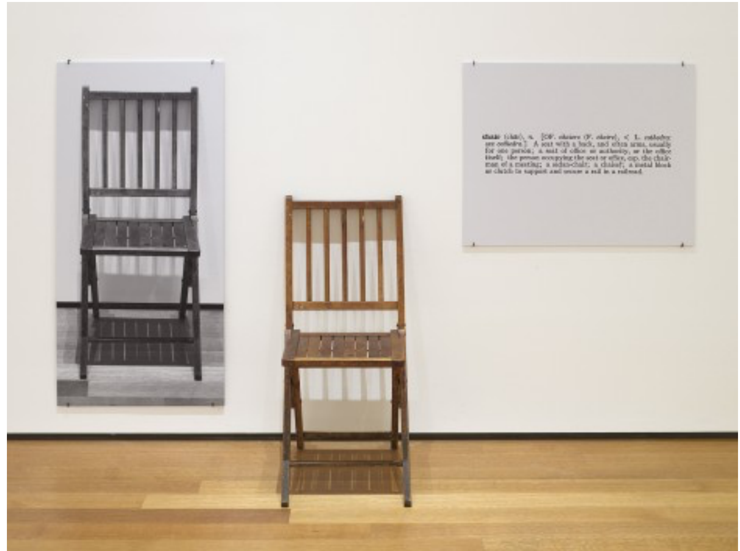
One and Three Chairs, by Joseph Kosuth (1965)